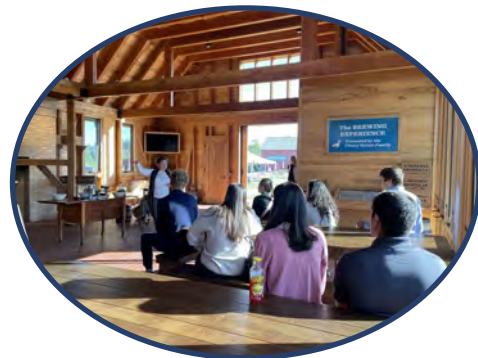
Waukesha County Business Alliance, Young Professionals meeting in OWW's Brewhouse

OWF has gifted over $9 million in support of OWW since 1984.