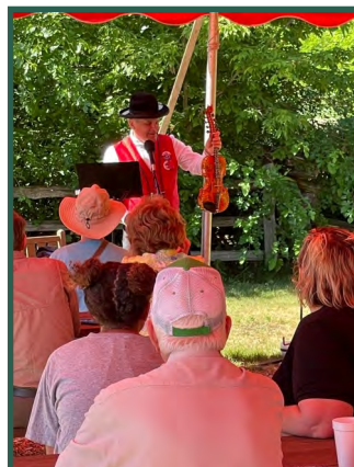
Friends Appreciation Day at OWW

Old World Foundation holds 8 endowment funds that are used to fund various projects and programs at Old World Wisconsin. We encourage you to consider creating an endowment fund to leave a legacy for Old World Wisconsin.