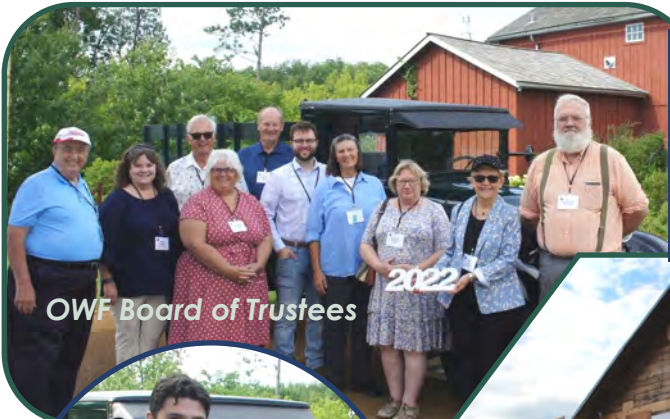
OWF Board of Trustees

Donors at $250 or more, were invited to a celebration of thanks at Old World Wisconsin in August... our Sunset Soiree.