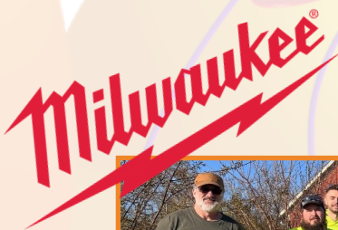
Volunteers from Milwaukee Tool-Mukwonago moved prairie plants across OWW

Thank you to our Corporate Partners who shared their time by volunteering for Old World Wisconsin!