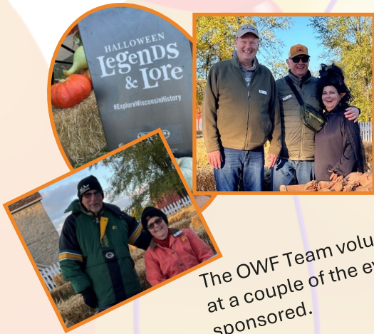
The OWF Team volunteering at a couple of the events we sponsored.